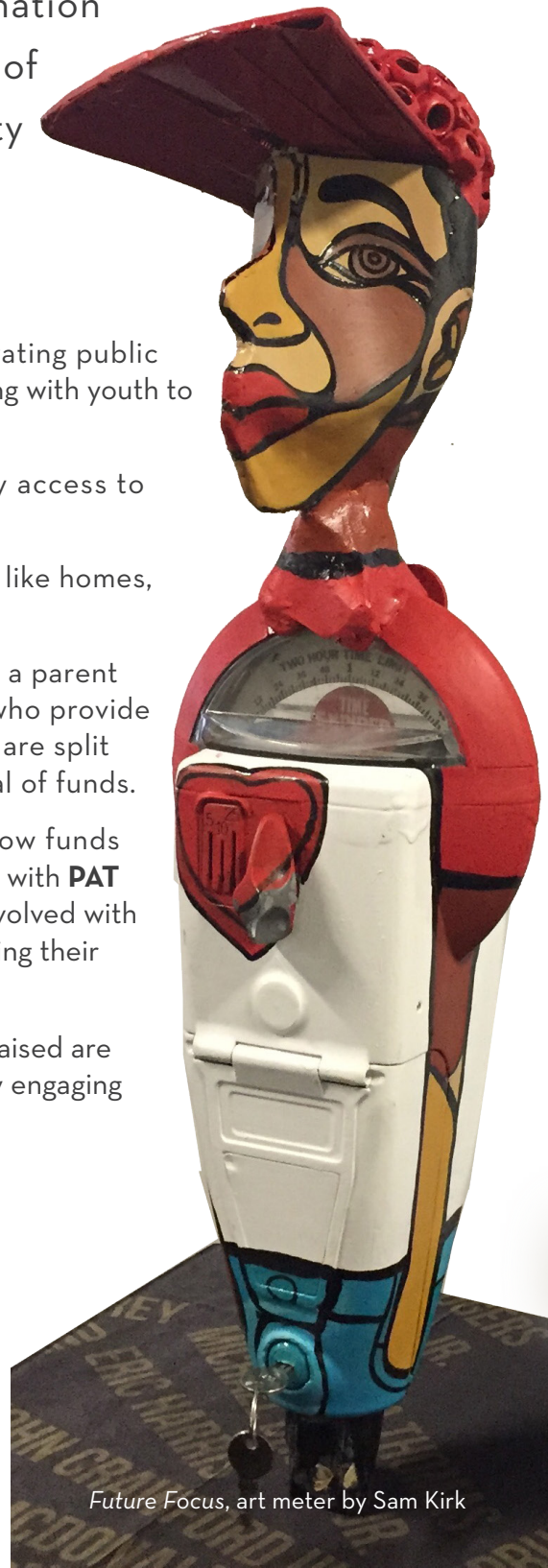
Future Focus, art meter by Sam Kirk